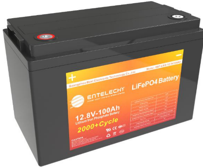
12V100Ah Battery outside picture (Picture only for you reference, result depends on production)